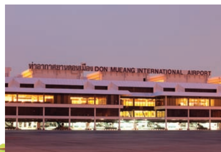
Don Muang Airport

If you need assistance for making travel arrangements, you may contact the International Students and Staff Office , but please be aware of the opening hours of the offices on campus, which are Monday through Friday from 8:30 a.m. to 4:30 p.m. (all offices are closed during weekends and official holidays ).